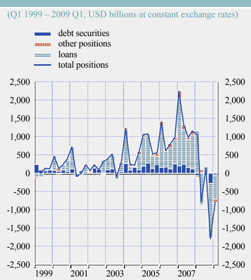
Chart A International financial claims by type of instrument

Note: Locational data, based on the resident principle.